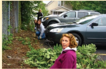
Freedom Baptist High

This year Alpha was blessed along with our regular volunteers with groups from high schools, churches, colleges, federated agencies, businesses and individuals who stepped out of their daily routines to provide relief for the staff and facility needs at Alpha. There is not doubt that the sacrifice of time and energy offered by community groups on behalf of Alpha makes a great difference. Their names and actions are carved on our hearts.