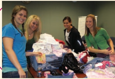
West Catholic High