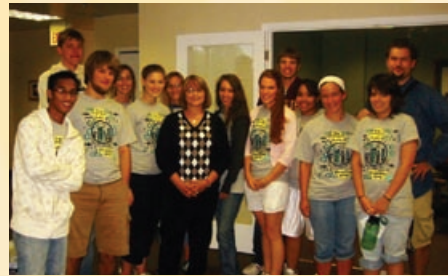
Calvin's Street Fest